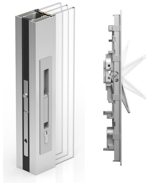
Integrated Handle & Lock 36 x 260mm