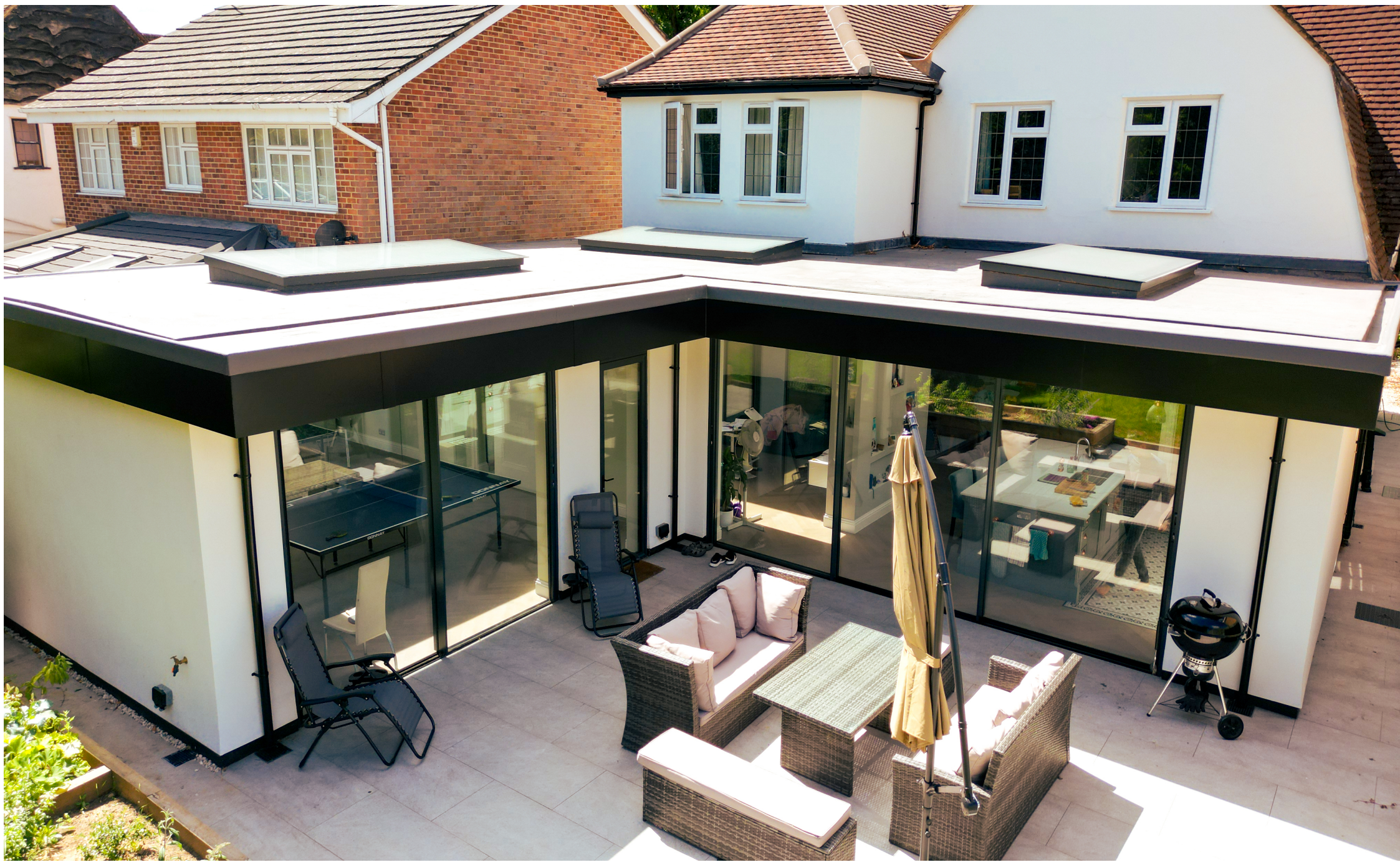
Project : The Ridings - Surrey